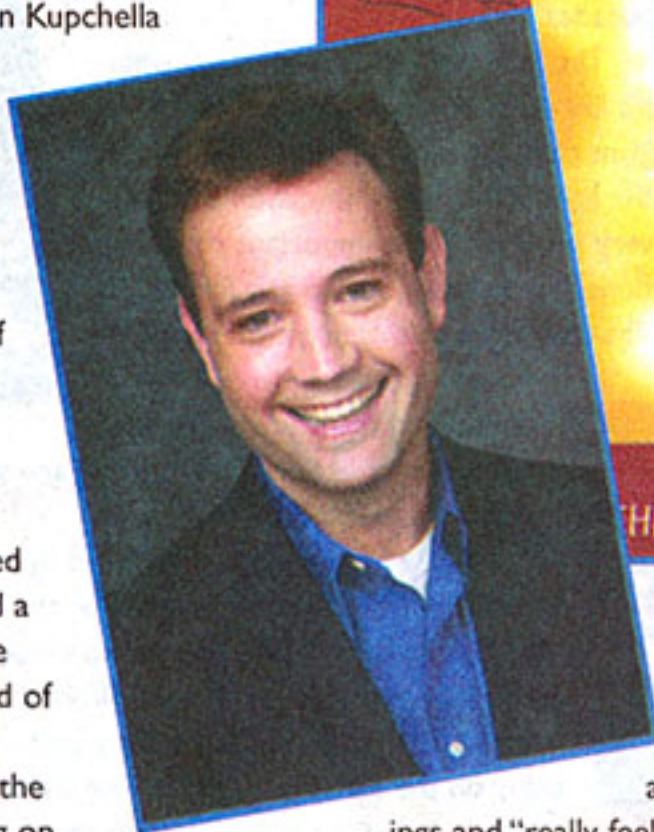
KUPCHELLA illustrated by WARREN HANSON